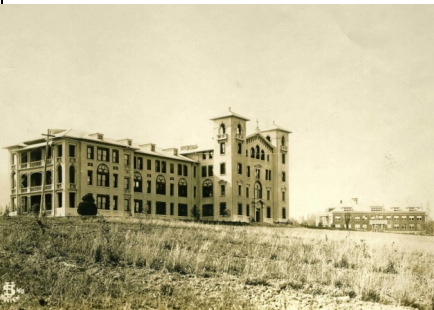
1912 Provincial House